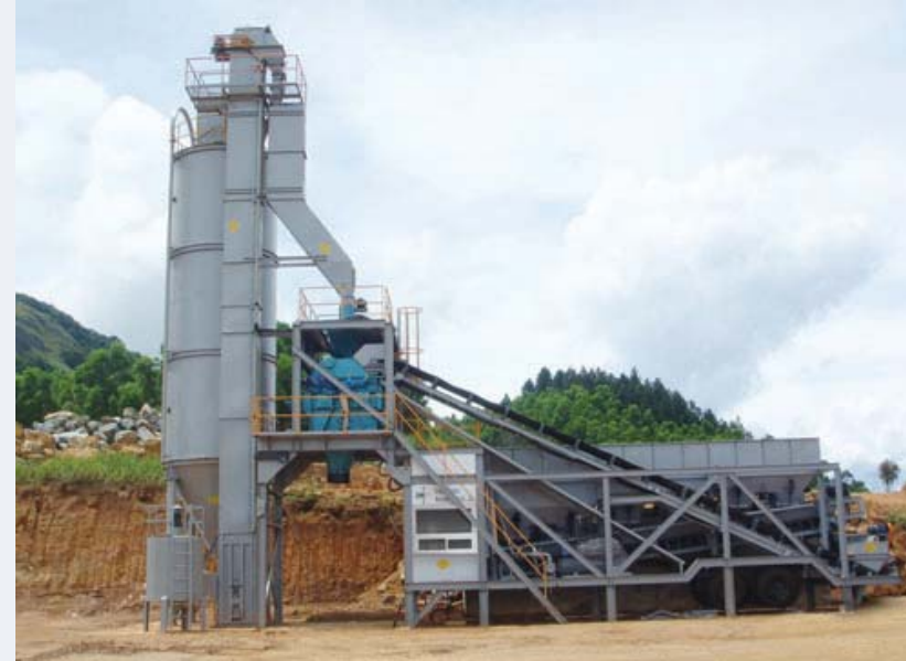
Mobile Concrete Batcher Plant

Mobile Concrete Batch Plant offers many advantages over previous the other type concrete batch plant.